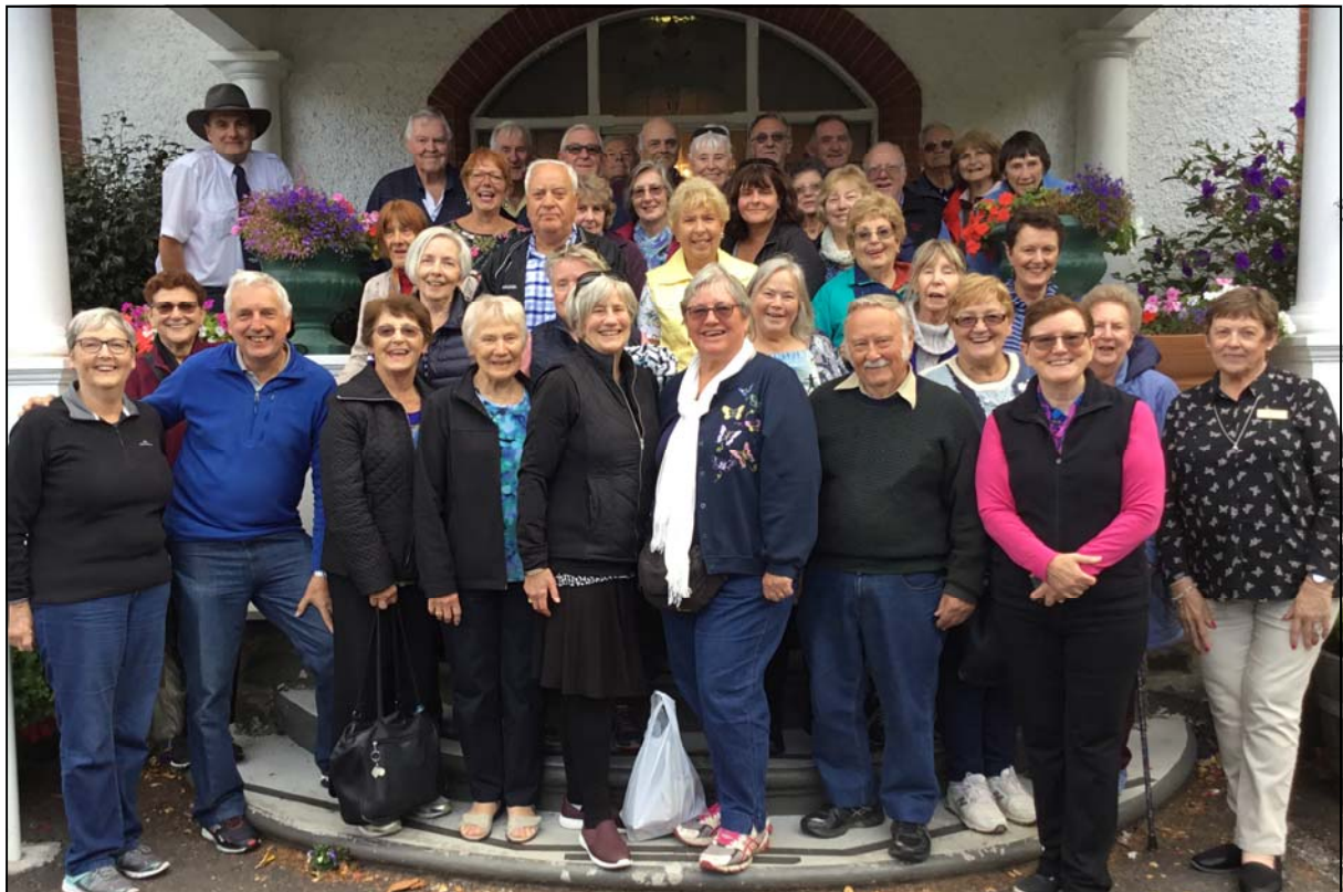
Group photo at our last stop (a chocolate factory - yummy) before boarding the 'Spirit of Tasmania' for our homeward journey.

Also up to 4 family members can share the one membership.