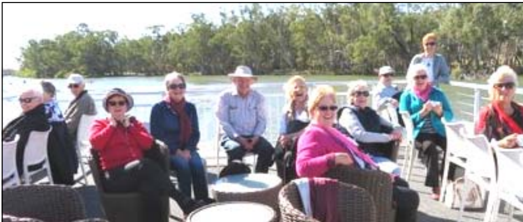
Members enjoying the Goulburn River Lunch Cruise

Also up to 4 family members can share the one membership.