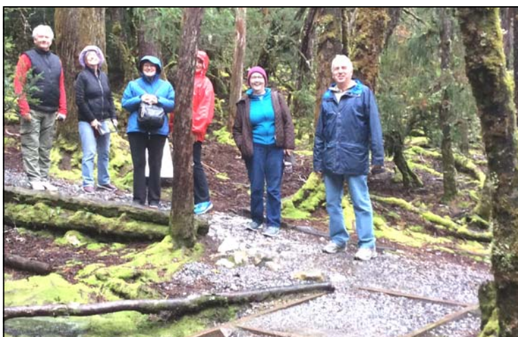
Going for a Forest Walk at Cradle Mountain, Tasmania