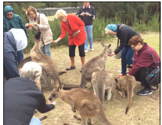
Getting friendly with the wallabies at Natureworld, Bicheno, Tasmania