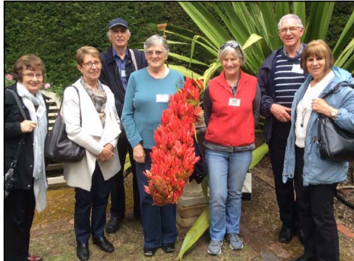
Members visited Beleura House & Gardens in November. The plant they are photographed with is Doryanthes palmeri Benth (commonly known as Giant Spear Lilly). This is the first time it has flowered in 17 years.