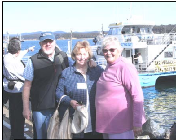
Our Cat Balou Cruise Boat at Eden Wharf