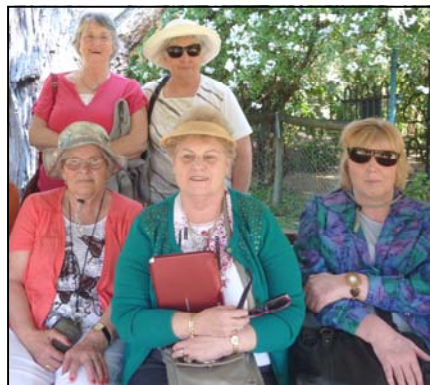
Some of our group waiting for their turn on the train