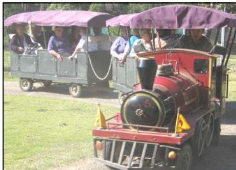
Train ride at Potoroo Wild Life Sanctuary