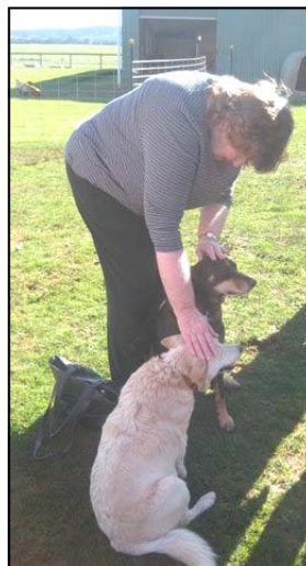
The dogs wanted some attention too