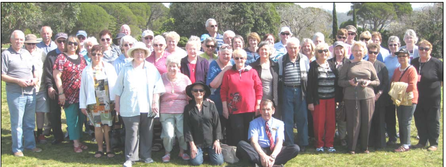
Group shot of members on our Merimbula trip in September